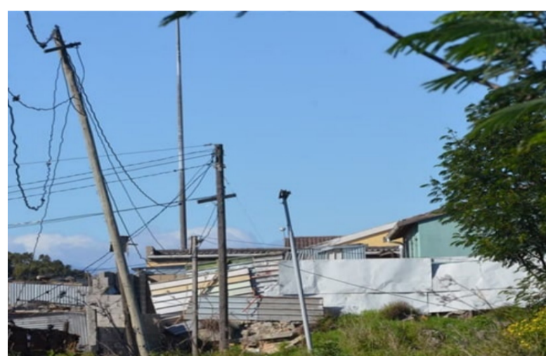
Esithombeni : Izigxobo zikagesi ezixhunywe ngokungemthetho.

UBala uqhube wathi u-Eskom ubhekene nezigameko eziningi zokuxhunywa ngokungemthetho, ukudlula imitha kanye nokuphazanyiswa, ukusebenza okungagunyaziwe kunethiwemi ukucekela phansi kwengqalasizinda kanye nokweba kanye nokungakhokhi nokungathengwa kwamathokeni kagesi. Uthe lokhu okulona uhlelo lukagqamcishi (load shedding), osekuphele izinsuku eziwu-104 lumisiwe eNingizimu Afrika. Ube esenxena amalungu ase Ningizimu Afrika ukuba abhalise futhi afakelwe ugesi ngokomthetho ukugwema izinkinga eziningi.