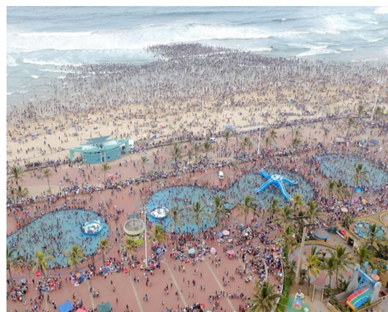
Esithombeni : Elinye lamabhishi laseThekwini I North Beach.

Kuthintwa okhulumela uMasipala weTheku, uNkk Gugu Sisilana, ucele ukuthi bathunyelelwe imibuzo nge-email, bese benikwa okungenani amahora awu-24 ukuphendula.