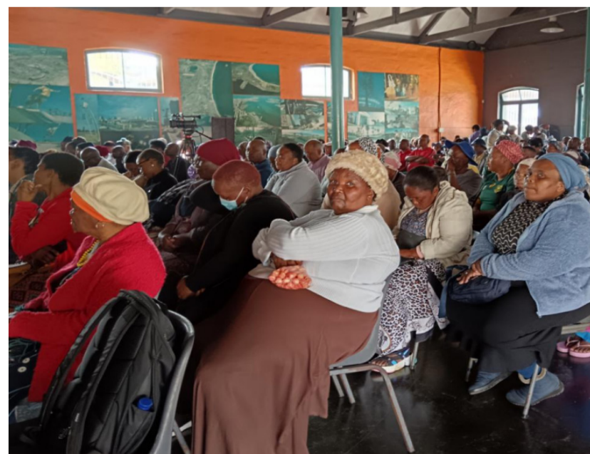
Esithombeni : UMasipala ubheka izindlela ezintsha zokuthuthukisa umkhakha wabahwebi eThekwini.